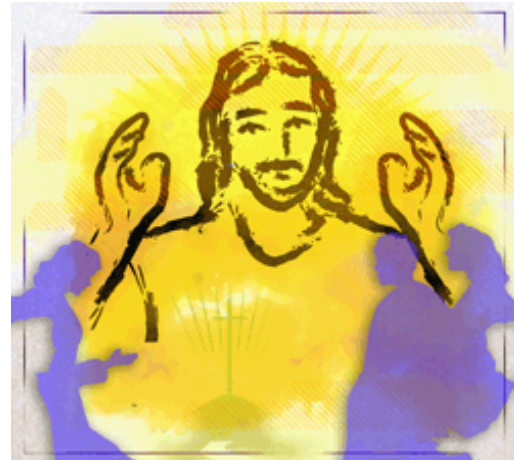
The joy of Jesus

The joy that Jesus offers his disciples is his own joy, which flows from his intimate communion with the One who sent him. It is a joy that does not separate happy days from sad days, successful moments from moments of failure, experiences of honor from experiences of dishonor, passion from resurrection.