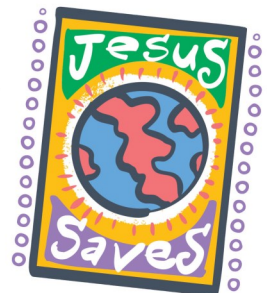
Answer: A (See John 12:47, NIV.)